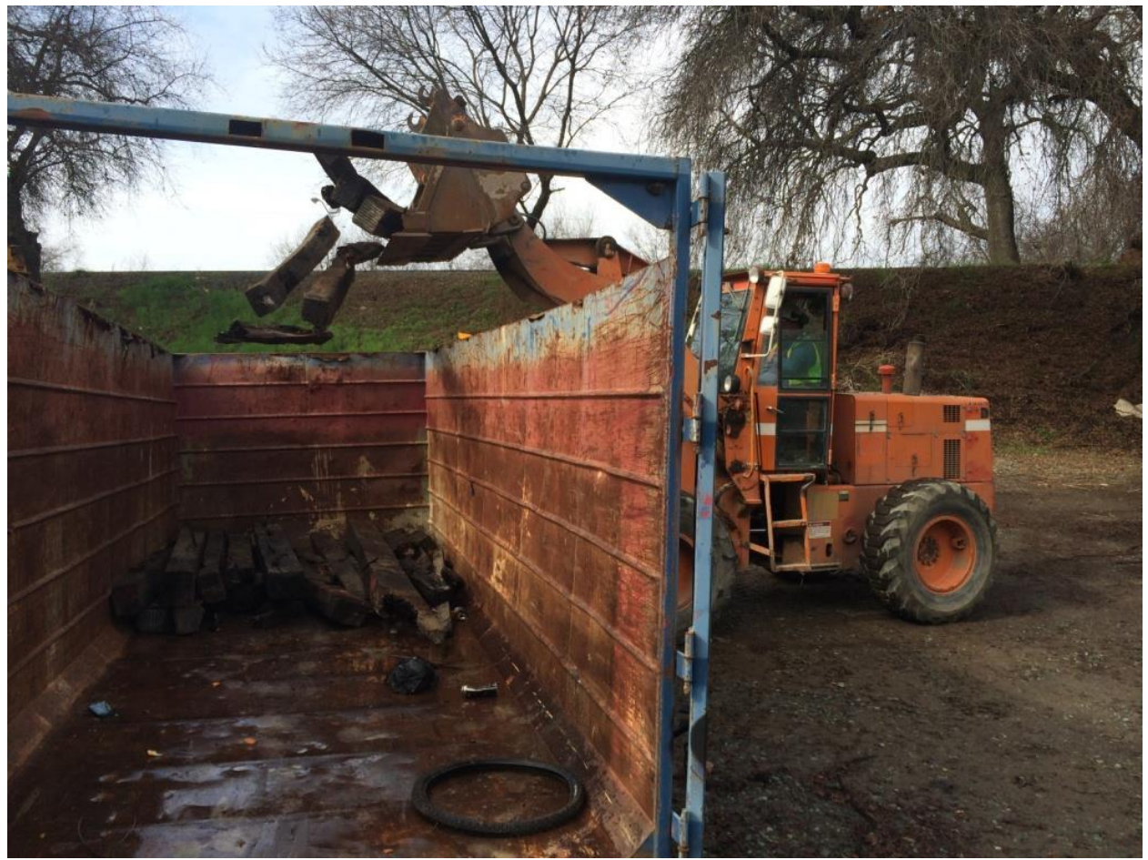
Frank in charge of the front-end loader dumps a bundle of dead ties into the dumpster