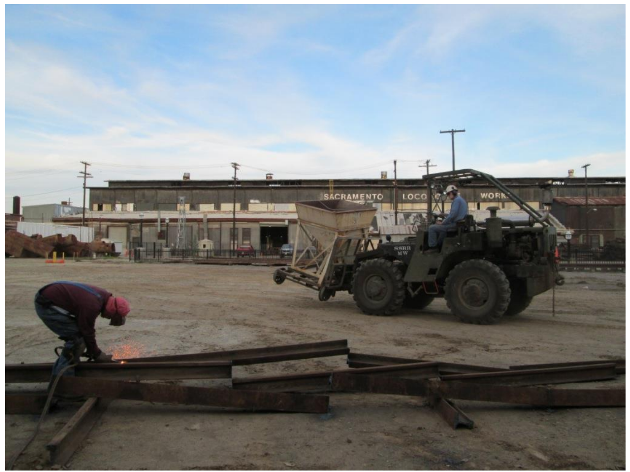
Cliff torch-cuts scrap rail while Alan moves a ballast hopper with Big Green